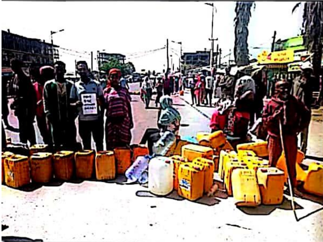
figure 4.2 shortage of pure water supply (field survey , 2023)