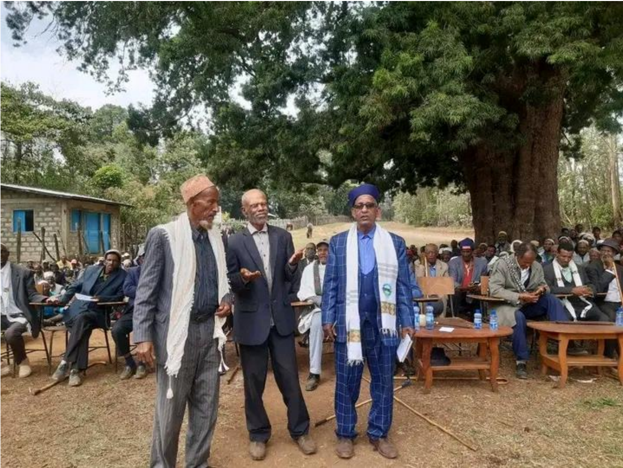
Figure 5: Wash Zigba Sera meeting on group discussion