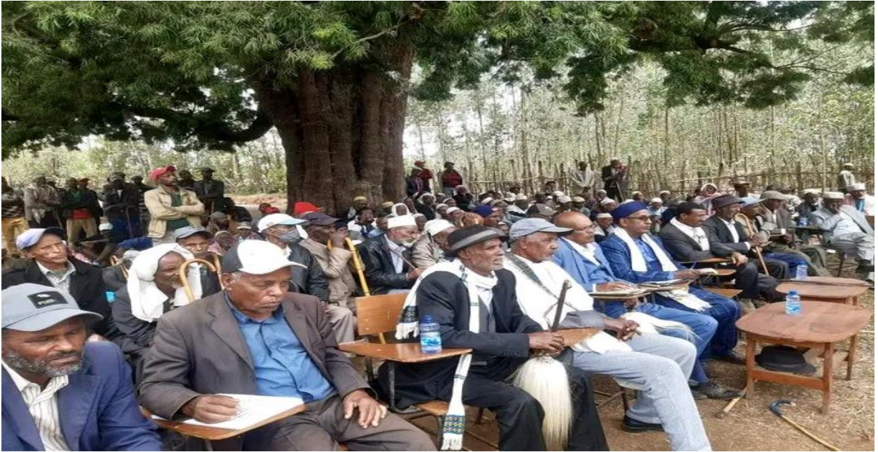
Figure 3: Wash Zigba Sera photo group discussion on the issues