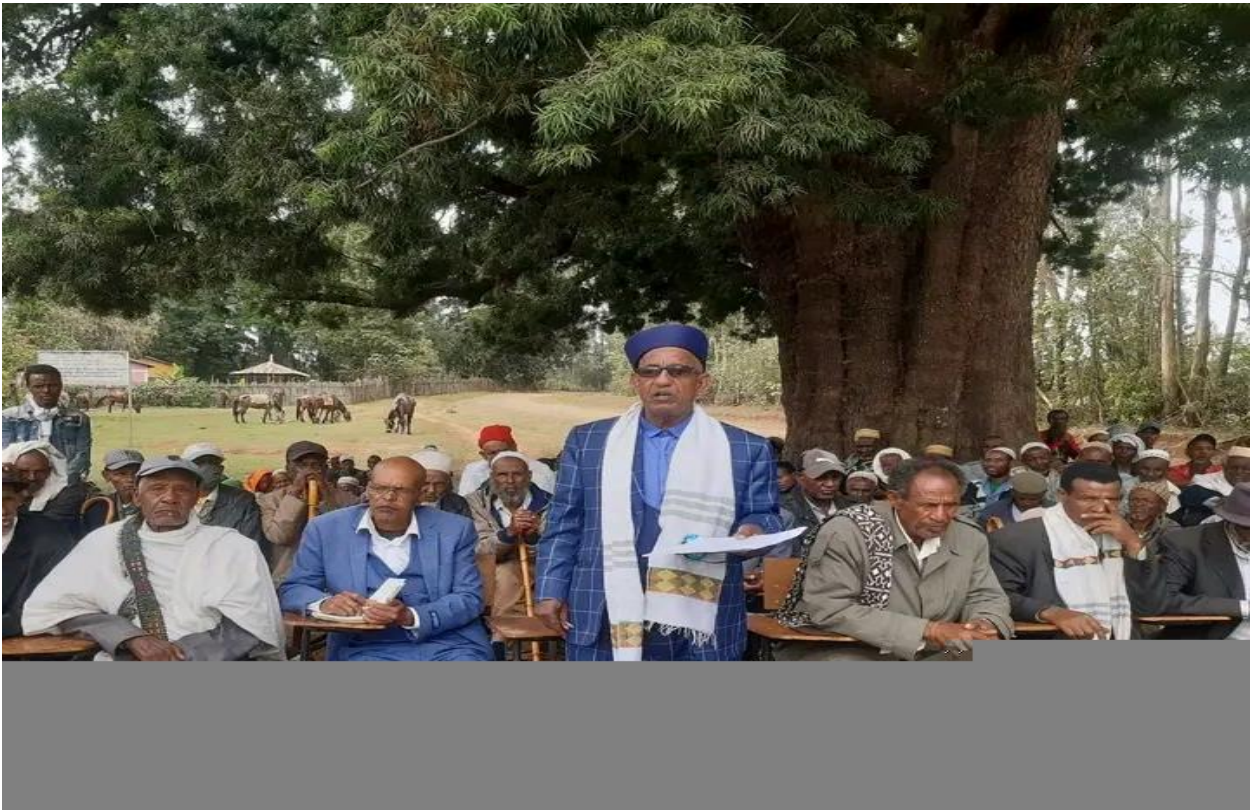
Figure 2: Wash Zigba tree/yellow wood

The term Wash Zigba is the place that originated from Wash Zeweyar kebele in Enor Ener Woreda. It refers to the setting place that traditional decisions are taken place and the sacred area. It serves as the venue of assembly.