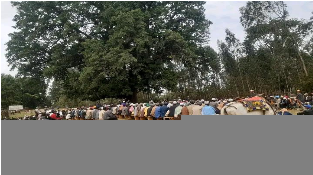
Figure 4: Wash Zigba Sera photo group discussion on the issues