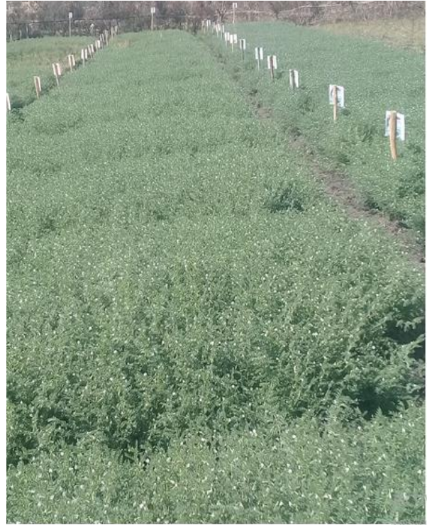
Figure 1c. Flowering stage of the trial