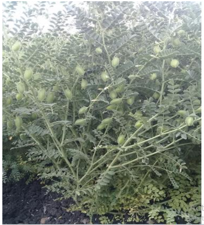
Figure 6. Stage of counting primary and secondary branch

The analysis of variance (ANOVA) showed the Number of Secondary Branches chickpea was highly significantly ( P < 0.0001 ) influenced by the two way interaction of NPSB blended fertilizer and MOP. The highest secondary branches chickpea was recorded (16.00) branches on a treatment received 150 kg NPSB \text{ha}^{-1} and 150 kg \text{ha}^{-1} fertilizer rates, Whereas the lowest secondary branches was recorded (5.67) at the control.