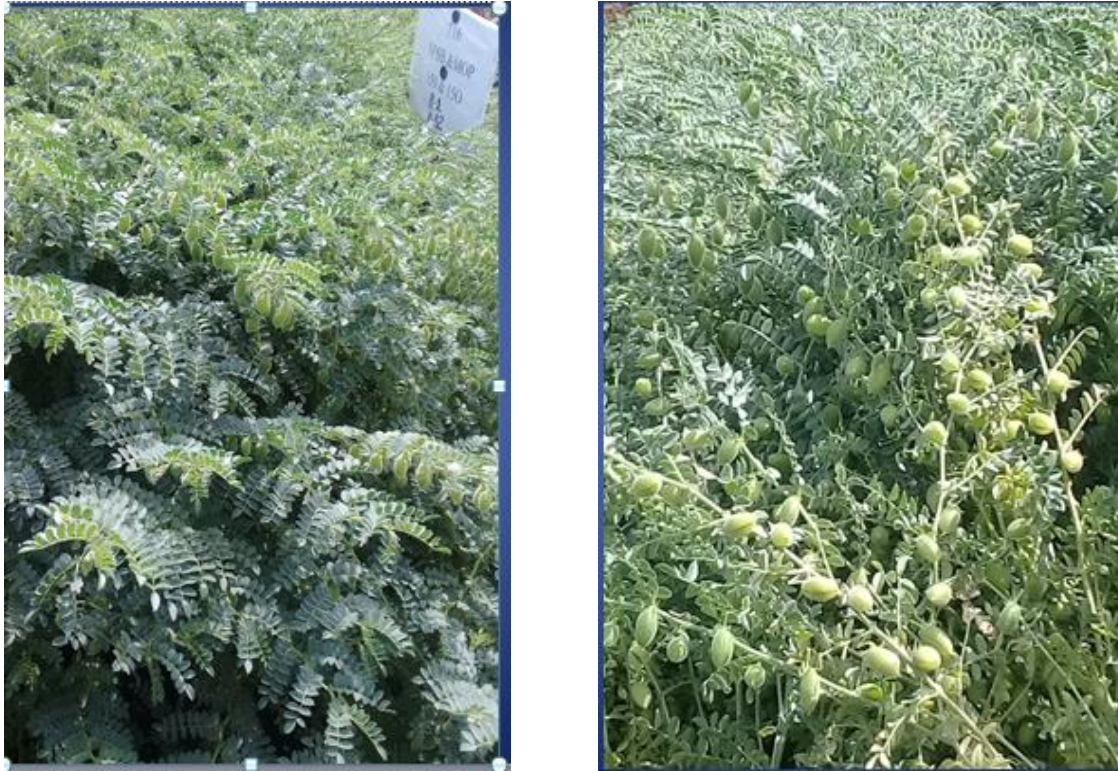
Figure 8. The performance of the trial and the number of pods looks like