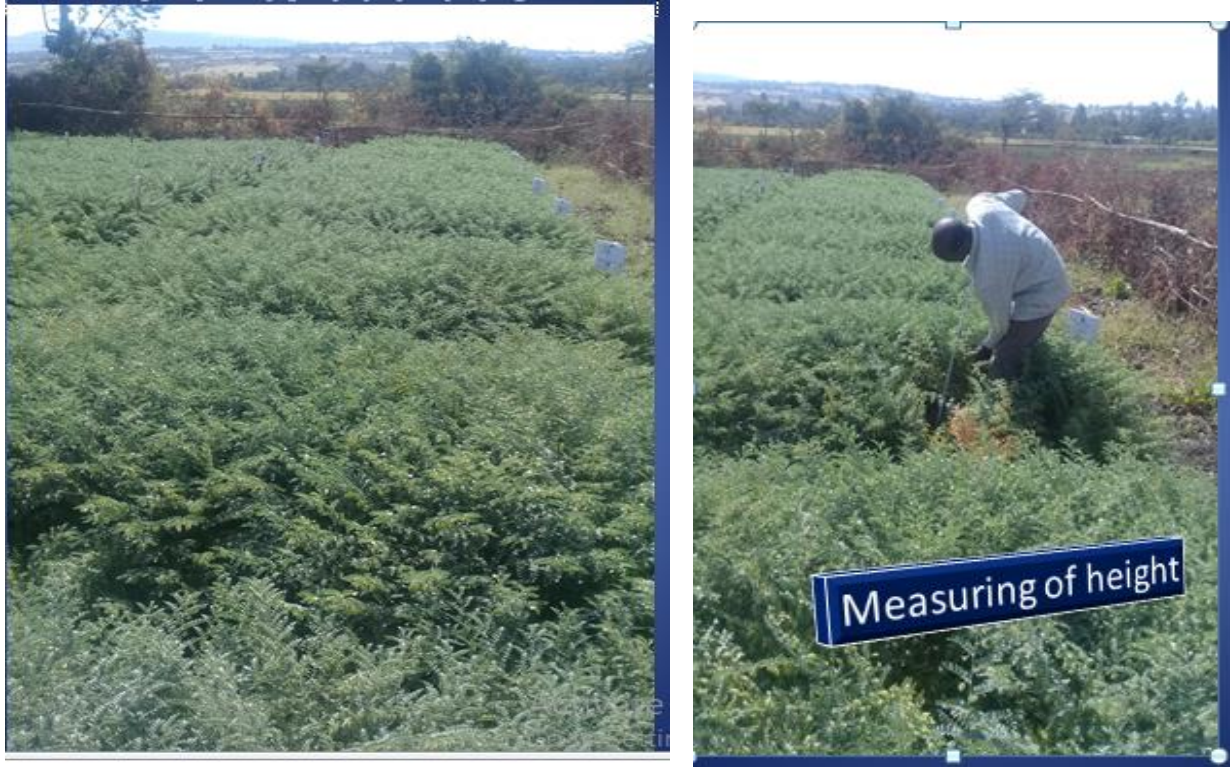
Figure 5. Stage of measuring plant height while completion of vegetative growth