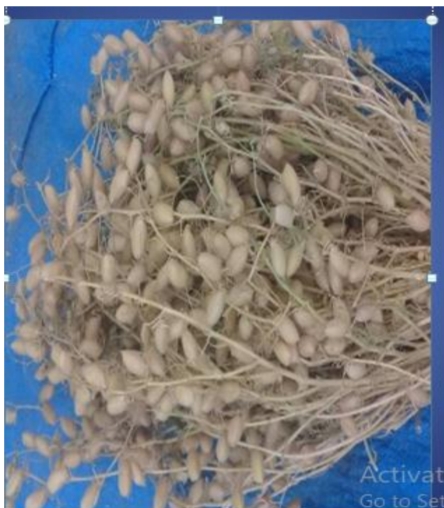
Figure 10. Stage biomass measured