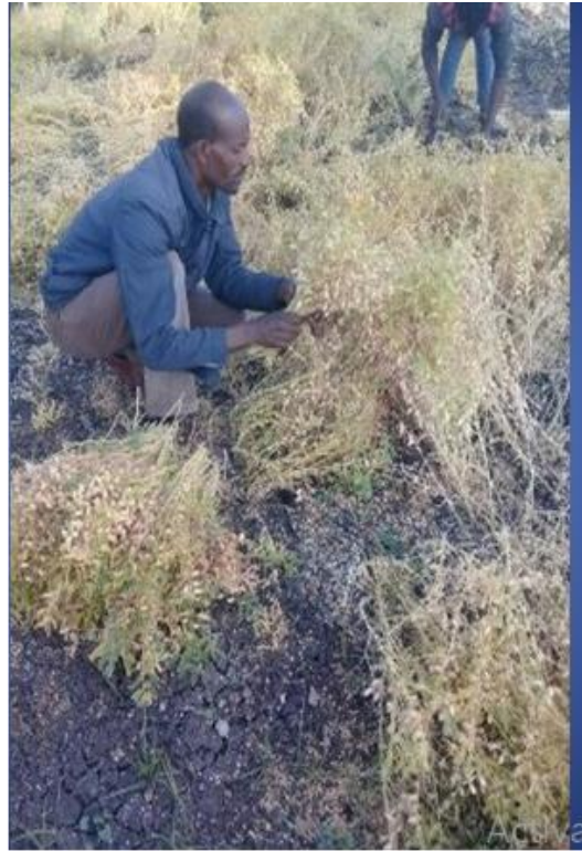
Figure 4. Maturity and/or harvesting time