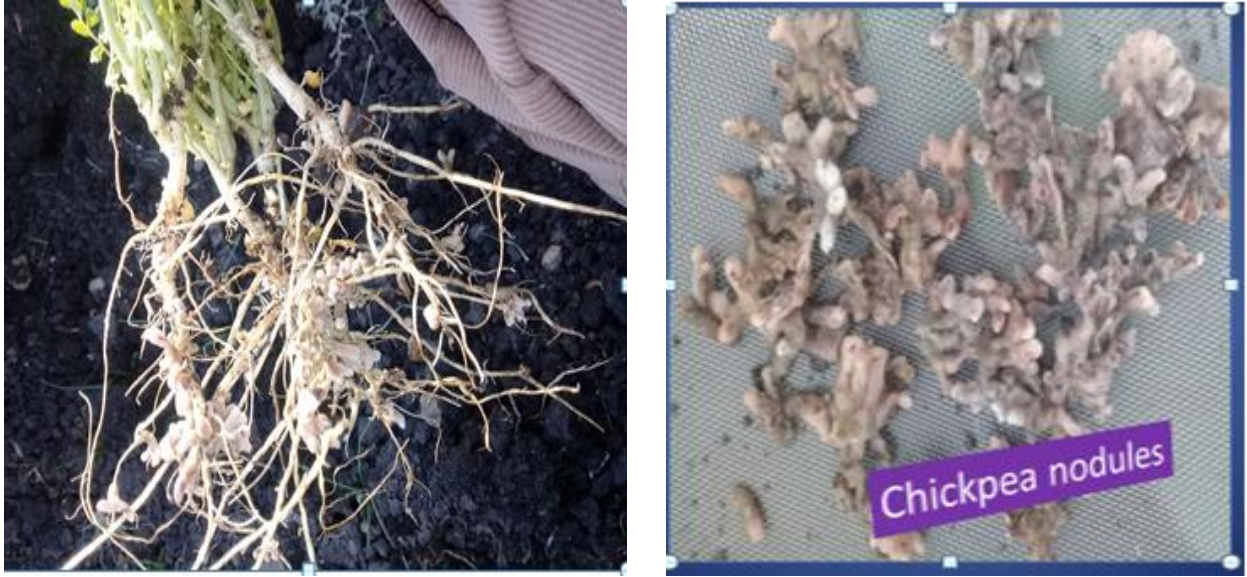
Figure 7. Stages of nodules data capturing