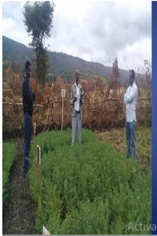
Figure 1a. Flowering stage of the trial