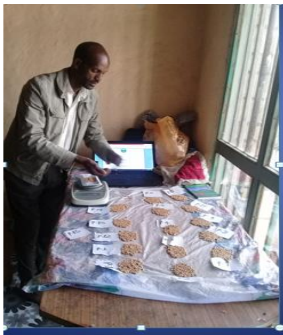
Figure 9. Stages of hundred seed weight measured