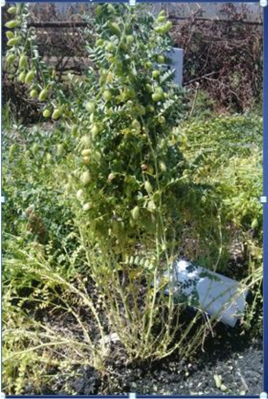
Figure 3. Grain filling period