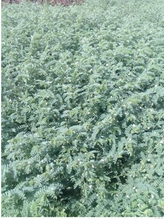
Figure 1b. Flowering stage of the trial