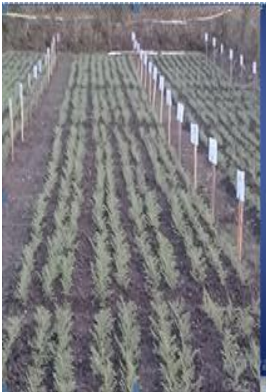
Figure 1. Vegetative stage of the trial

ANOVA showed that days to 50% flowering was highly significant ( P < 0.0001 ) influenced by two way interactions between MOP and rates of NPSB fertilizer (Appendix Table 1). Thus, a treatment with 0\text{kg NPSB ha}^{-1} was earlier (88.33 days) to 50% flowering and the longest days to 50% flowering (91.00) was observed on the interaction rate of 100\text{kg NPSB/ ha}^{-1} and 100\text{kg MOP/ha}^{-1} fertilizer application (Table 4 and Figure 1a,1b & 1c). The data obtained in this study revealed that with an increase in the rate of the blended fertilizer date of flowering was longer. Moreover, significant variations among different levels of NPSB application might be due to enhancing property of (NPSB) in many aspects of plant physiology like process of photosynthesis, flowering, seed formation and maturation. This means that time of beginning of flowering is always earlier by NPSB fertilizer deficiency. Among macro nutrients Muriat of Potash (MOP) plays a vital role in photosynthesis, enzyme activation, protein synthesis and resistance against the pest attack and diseases (Arif et al. , 2008). The present finding confirms the findings of Acharya et al. (2007) who observed that phosphatic fertilizer promotes flowering, seed formation and crop maturity.