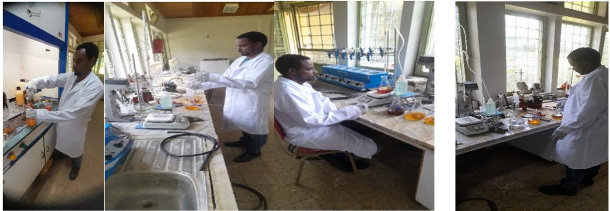
7.2. Some laboratory analysis photo collections