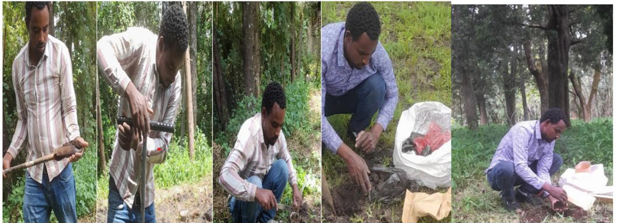
7.1 Some field sample collection photos